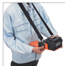
Work table WT-15