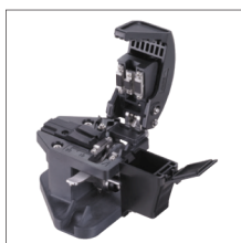
Table-top cleaver FC-5S