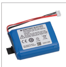
Battery pack BU-15