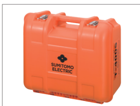
Carrying case CC-15