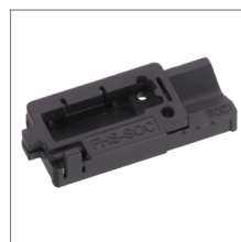
Connector holder FHS-SOC