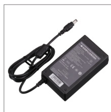
AC adapter ADC-15